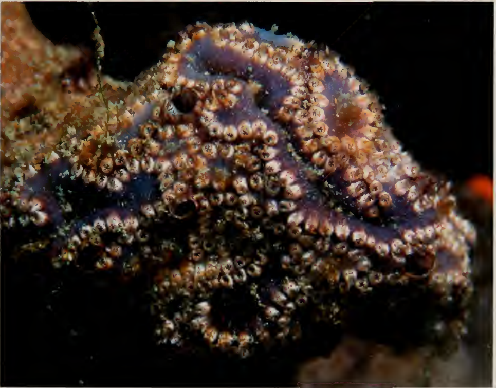
Fig. 3. Botrylloides perspicuum Herdman, 1886.